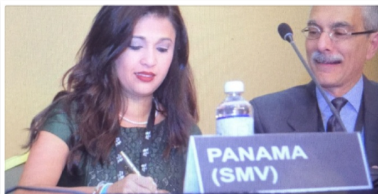
Panama's Securities Market Superintendent, Marelisa Quintero de Stanziola.